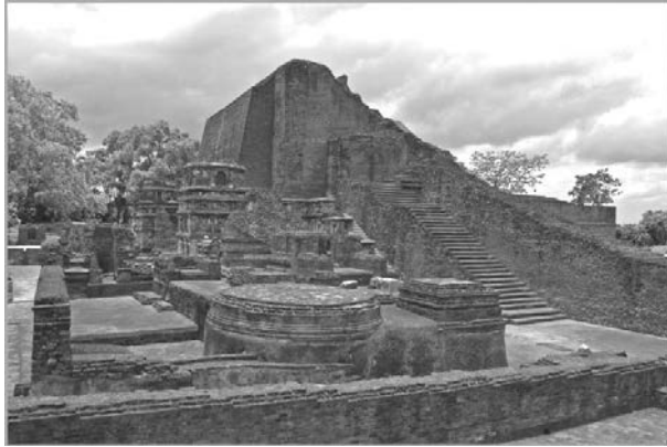
Figure 3.1 The Stūpa of Śāriputta

The report in the Anupada-sutta that Śāriputta determined the mental states of each absorption one by one endows the Abhidharma approach to analysis with the prestigious authority of having been the actual form of meditation practice undertaken by the disciple whom the early tradition reckoned as outstanding for his wisdom. 44