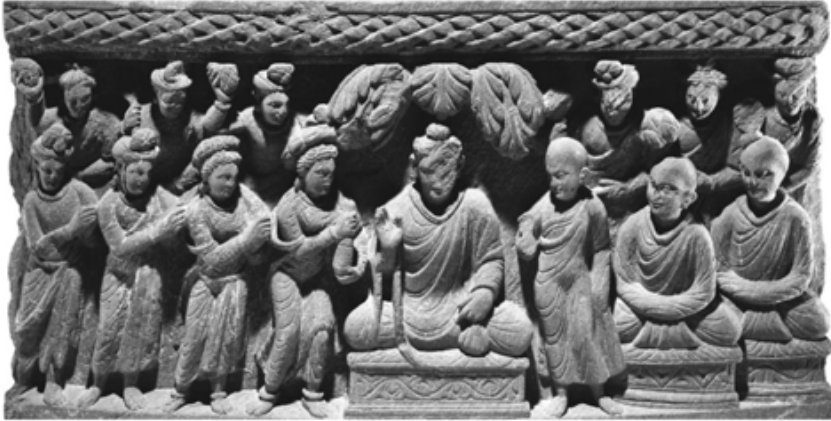
Figure 2.2 Mahāprajāpatī Requests Ordination

Only the Saṃmitīya Vinaya takes up a related case, prohibiting a nun from asking a monk difficult questions. 73 Thus the Abhidharma is not mentioned in any of the Vinaya versions of this particular principle to be respected.