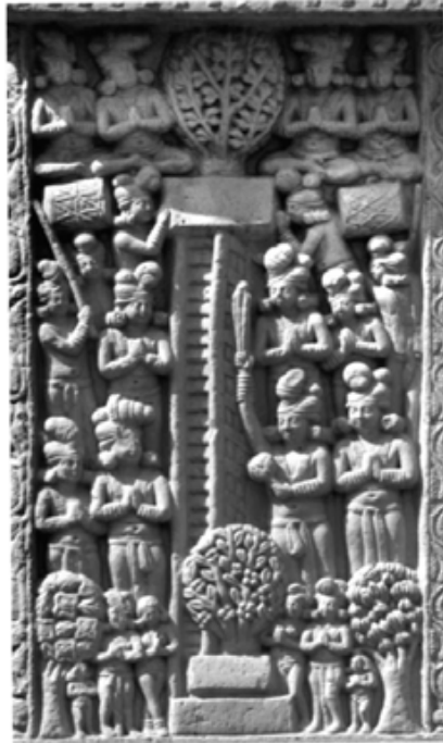
Figure 4.2 The Buddha's Descent from Heaven

visiting India in fact describe the remains of the stairs that were believed to have been used by the Buddha on this occasion. 96