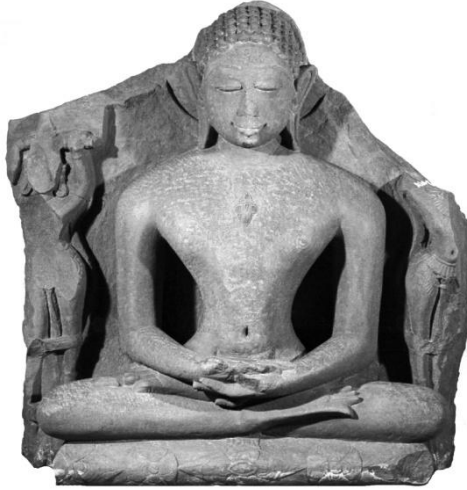
Figure 3.3. Jain Tīrthāṅkara

Indian setting, a claim to omniscient knowledge was made by the leader of the Jains. 90 The Buddhist texts reflect awareness of such a claim. 91