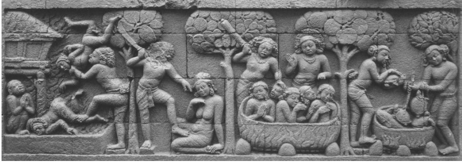
Figure 2.3 Punishment in Hell

reliefs well beyond the Indian subcontinent, namely the panels of the Borobudur stūpa in Java. 109