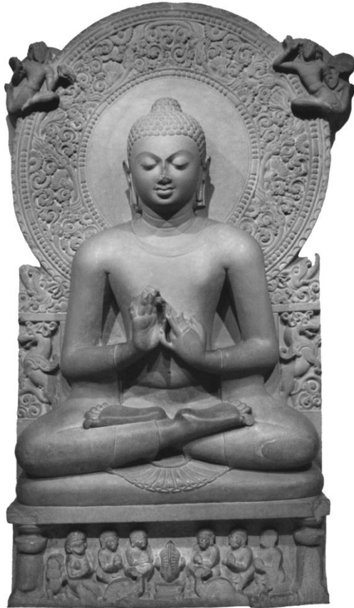
Figure 3.2 Turning the Wheel of Dharma

The relief shows the seated Buddha with his hands in the gesture of setting in motion the wheel of Dharma. Below the Buddha in the centre is the wheel of Dharma, with an antelope on each side, reflecting the location of the first sermon at the Mṛgadāva. The wheel is surrounded by the first five disciples, who listen with respectfully raised hands.